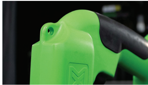
Harness / tether hole